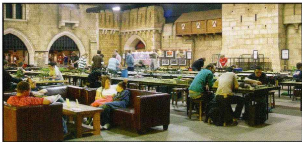
View of the main gaming arena

At the heart of Games Workshop's headquarters is Warhammer World our purpose-built hobby, gaming and visitor centre