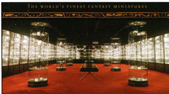
The Citadel Miniatures Hall